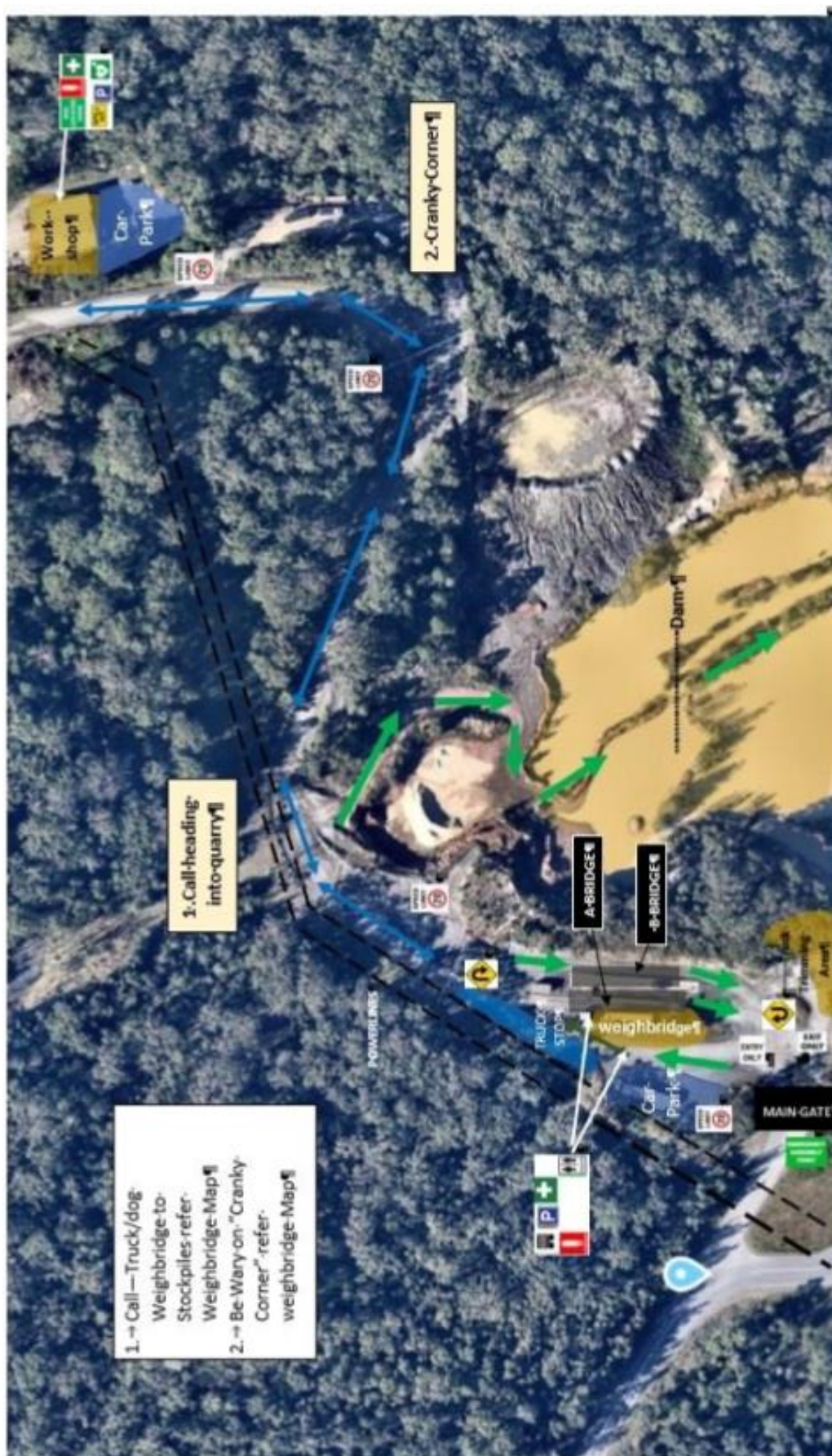
Figure 4 Location of Potential Pollutants and Safety Equipment.