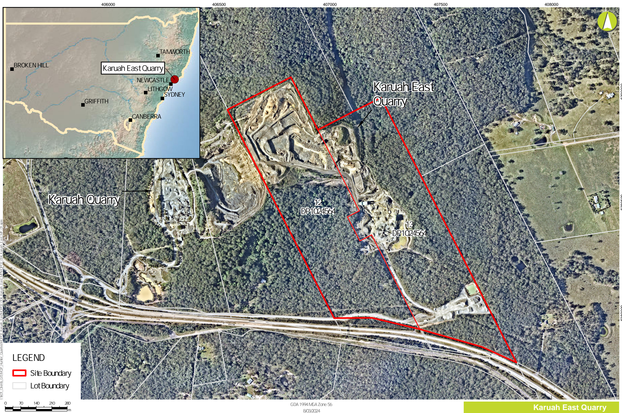
FIGURE 1 - Regional and Local Context Plan