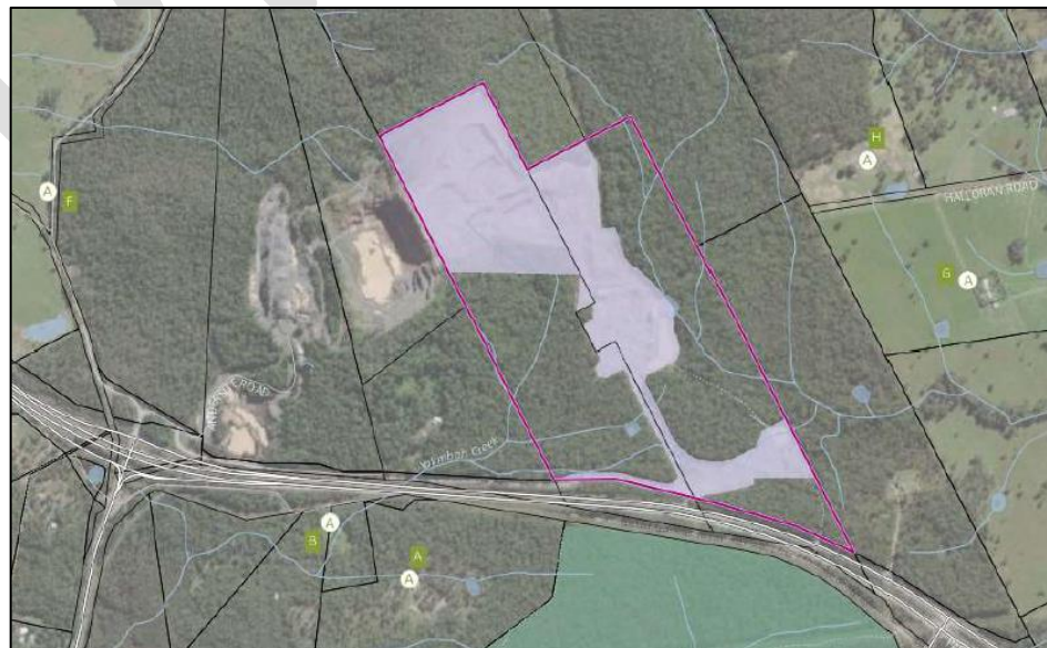
Attended Noise Monitoring Locations