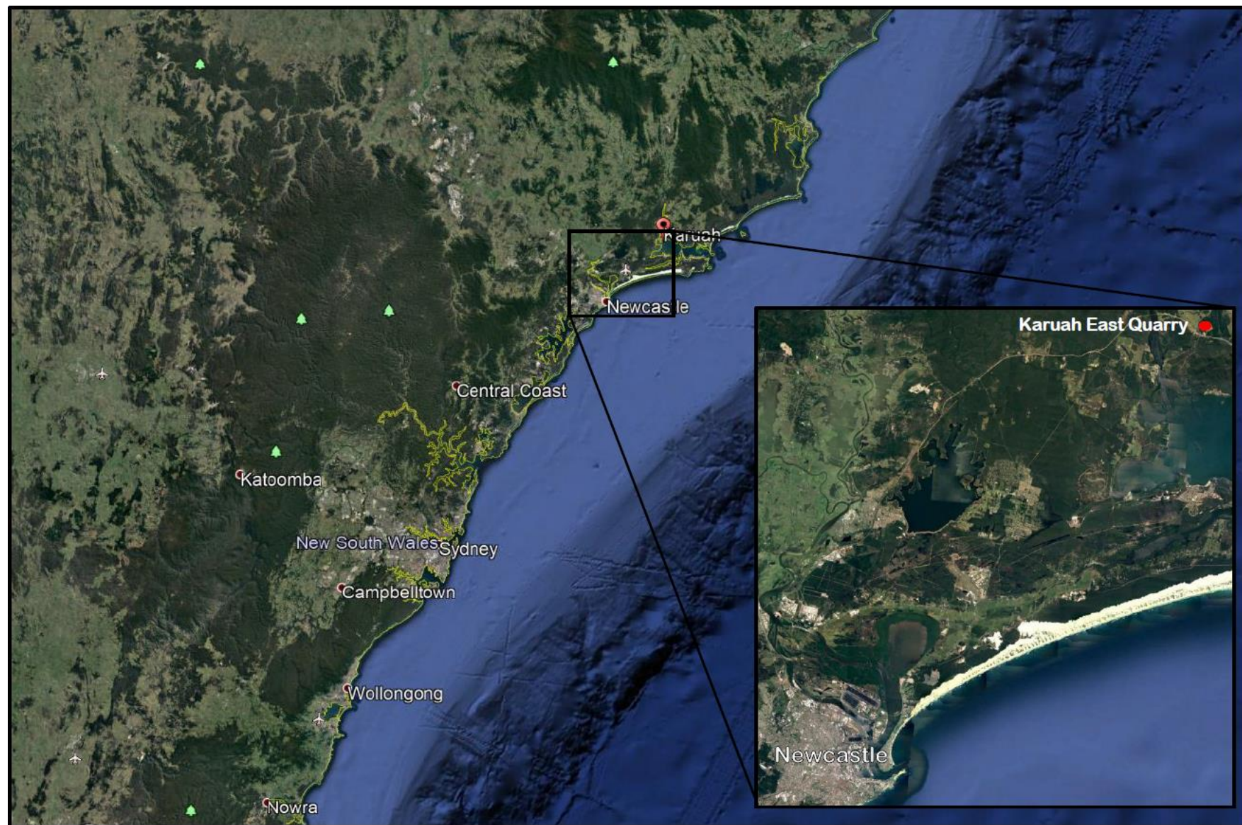
Figure 1 Regional context of Karuah East Quarry